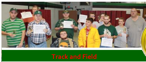
Track and Field