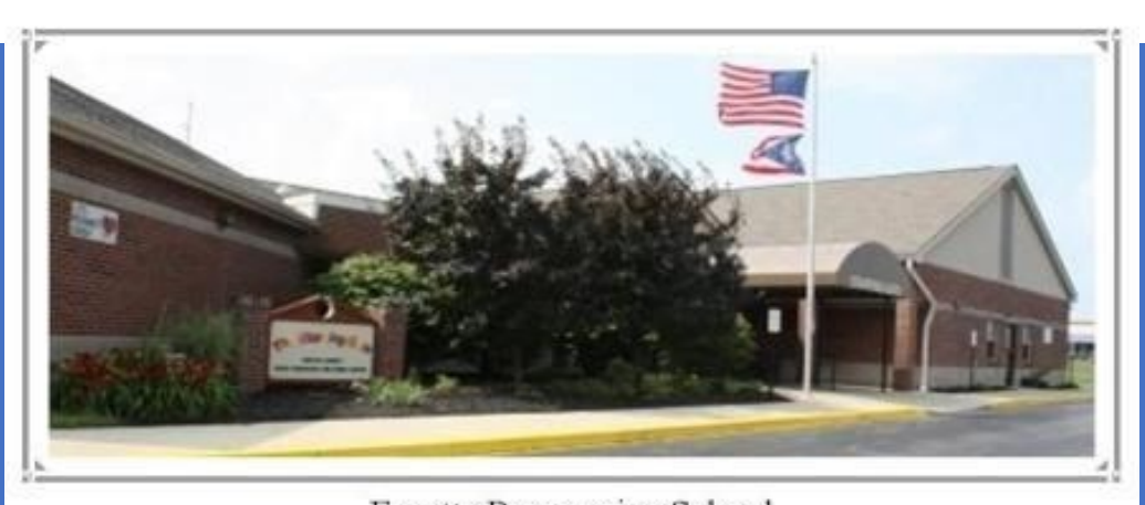
Fayette Progressive School